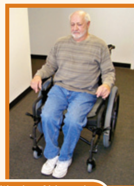
Part # 450.4060 18" x 16"