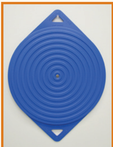
Part # 450.0380 15" Diameter