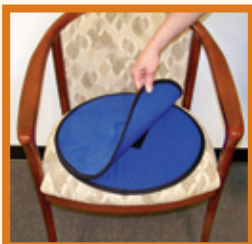
Large Part # 8.01 18" Diameter (shown)